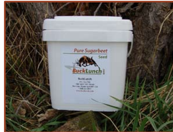
BuckLunch contains sugar beets, which are a superior deer attractant.

Do you run a farm supply store, co-op, seed dealership or sporting goods store? We are looking for retail partners! Send us an email or call us at 1-888-331-8997.