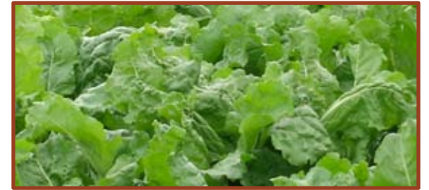
Mature Sugarbeet Tops (4-5 Months)