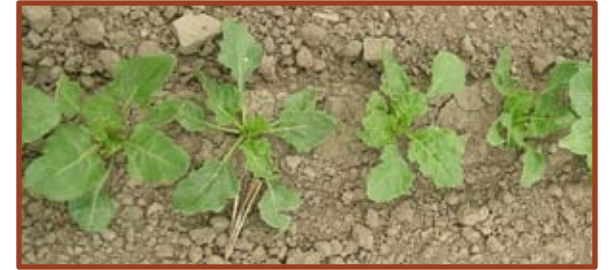
Sugarbeet Seedlings (5-7 Leaf Stage)