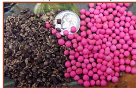
BuckLunch Sugarbeet Seed: Bare Seed (left), Treated Seed (right)

Our sugarbeet seed meets the high standards of commercial sugarbeet growers, which means our seed has excellent germination, vigor and emergence characteristics. Our seed is tested for germination and purity to ensure its quality. Treated seed is coated with fungicides (Apron and Thiram) that protect the seedlings from soil-borne and seed-borne diseases as they germinate and emerge.