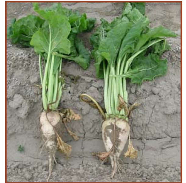
Full Sugarbeets (4-5 Months)